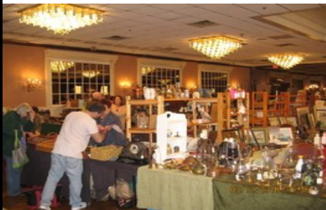
A scene from last year's show.

This event is the Historical Society's major fundraiser for the year. It helps to support our programs and ongoing archiving project. We hope to see you there! If you can volunteer for an hour or two that day to help